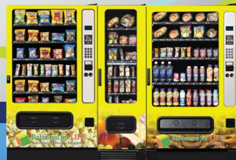
Full Range of School Vending Machines for Profit & Health.