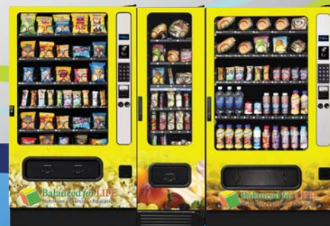
Full Range of School Vending Machines for Profit & Health.